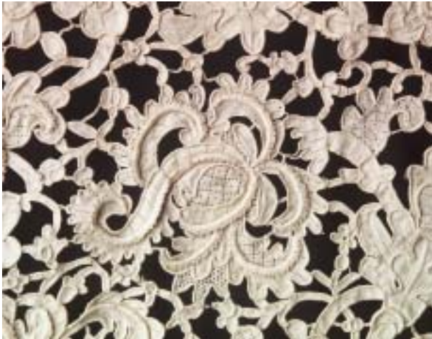
A flounce of Venetian gros point needle lace, 1650–75.