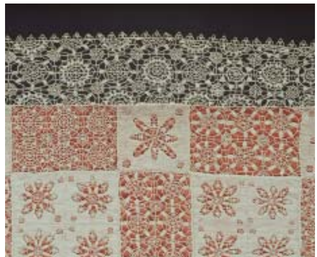
Detail from a church altar cloth, thought to have been made in Spain in the early 1600s by nuns or devout parishioners.