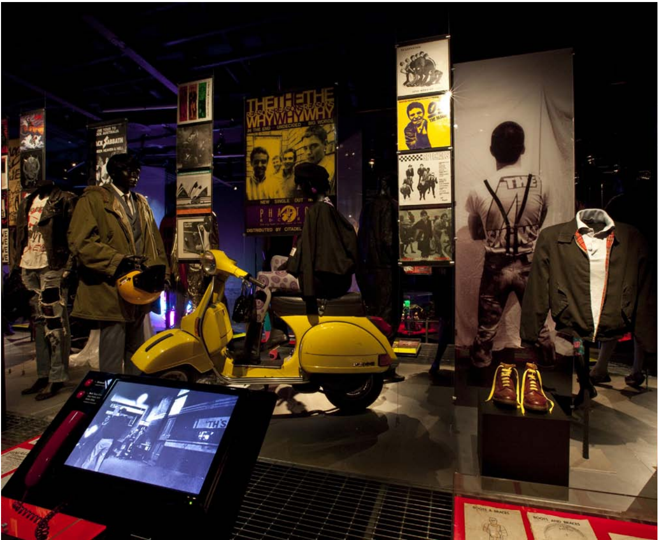
Above: 'Subcultures' section in The 80s are back exhibition.