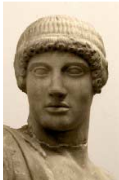
Head of Apollo, west pediment, Temple of Zeus, Olympia statue

I t is against this background that the magnificent sculptural decoration of the Temple of Zeus stands out as startlingly different. The figures are carved in what is often referred to as the “Severe Style”. This modern term is used to indicate that although bodies and faces in Greek art in those early years of the “Classical Period” are in a more naturalistic manner, drapery is still very heavy, and gestures and emotions are restrained. However, on the west pediment, where the grimaces of pain on the centaurs’ faces contrasts with the calm expression on the Lapiths, it can be seen that the sculptors have perhaps chosen not to show emotion, rather than being incapable of depicting it. The modern viewer needs to know that ancient Greek heroes, such as the Lapiths in this battle, were thought of as achieving their success without effort, feeling no pain, and rarely suffering grief. Therefore, even in a pitched battle against the forces of barbarism, which is what the centaurs really represent, the Lapiths remain calm and truly heroic.