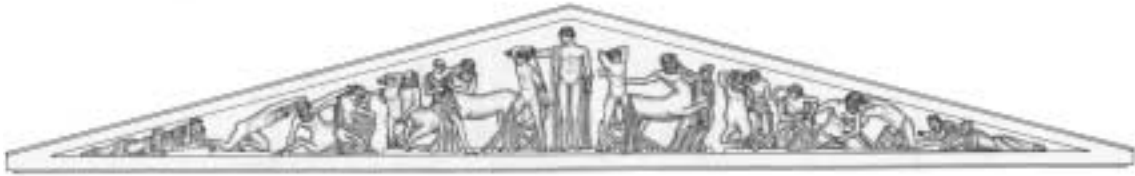
Reconstruction drawing of the west pediment sculpture; drawing David Loong

T he tall central figure is Apollo, son of Zeus. As the god of music, light and youth Apollo represented all the virtues of civilisation. He was also closely associated with oracles , the method by which the gods' wishes were most directly made known. Apollo was the god worshipped at the next most important Panhellenic Festival , at Delphi. In all these capacities, he, after Zeus, was the most appropriate god to supervise over a battle between the Lapith Greeks and the savage centaurs on a temple at Olympia. On Apollo's right, under his outstretched arm, is the groom Perithoos, sword overhead, about to smite the centaur grappling with Deidameia. On the other side of Apollo is Theseus with his axe. The long centaur-horse bodies at the side of the heroes punctuate the fighting groups, which are arranged then, on each side, into a pair (centaur and Lapith boy) and a trio (centaur, Lapith woman and Lapith man), watched in horror by two reclining elderly female servants.