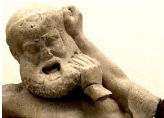
Detail of part of the west pediment sculptures: a Lapith girl fighting a centaur

T his pediment shows a battle at a wedding. Perithoos, King of the Lapiths in northern Greece, had invited his neighbours, the centaurs, to his wedding. Centaurs were half men-half horse creatures and were notorious for behaving badly when affected by alcohol. In some myths, even the fumes from a wine jar were sufficient to cause them to run amok. The centaurs, wild with drink, had begun to attack the bride, Deidameia, and other guests, intending to rape them. The groom, Perithoos and his great friend Theseus, the hero-king of Athens, led the attack on the centaurs and threw them out.