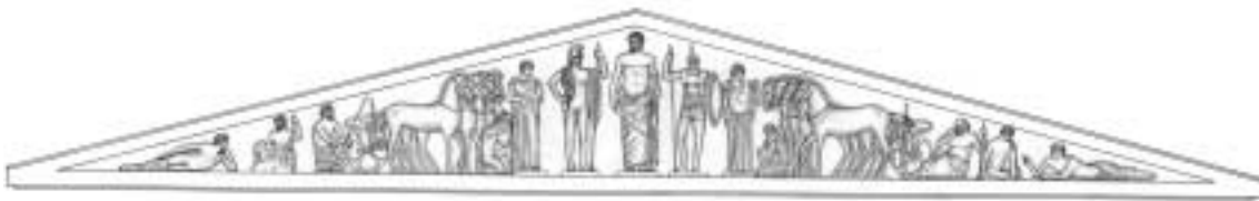
Reconstruction drawing of the east pediment sculpture

To avenge his father's death, Orestes killed his mother and her lover Aegisthus. Himself now guilty of a blood crime, Orestes fled Mycenae. The Furies, who took no account of vengeance, turned Orestes mad as punishment. Eventually he arrived at Delphi, where he was purified of his blood-crime, bringing to an end the dreadful cycle of the curse of the charioteer Myrtilos.