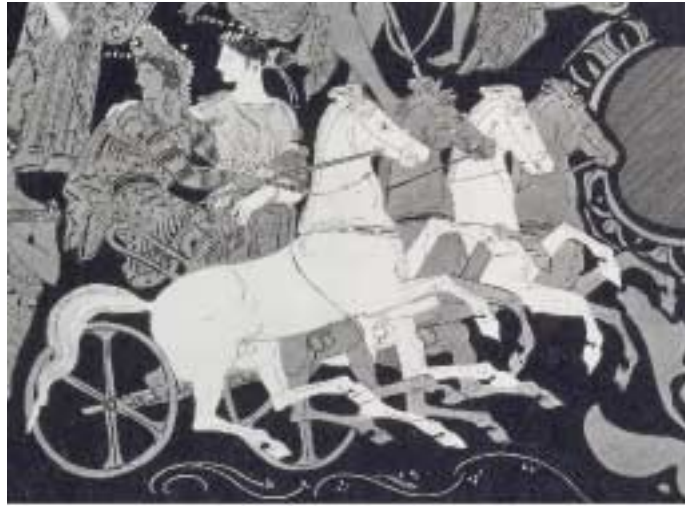
Detail of Pelops and Hippodameia in their chariot Bell krater in Naples, from Furtwängler & Reichhold, plate 146

After the king died, Pelops and Hippodameia refused to pay the bribe, which was either money or the favours of Hippodameia for a night. To get rid of Myrtilos in order to hide their double dishonesty, Pelops threw the charioteer off a cliff into the sea. Before he died, Myrtilos cursed the House of Pelops.